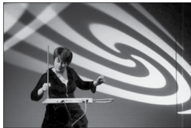
Bellingham Electronic Arts Festival showcased electronica and dance artists from Vancouver B.C., Seattle, New York and Colorado.

Western's Children's literature Conference is an annual tradition for all teachers, librarians, readers and writers who enjoy children's literature. Among the presenters