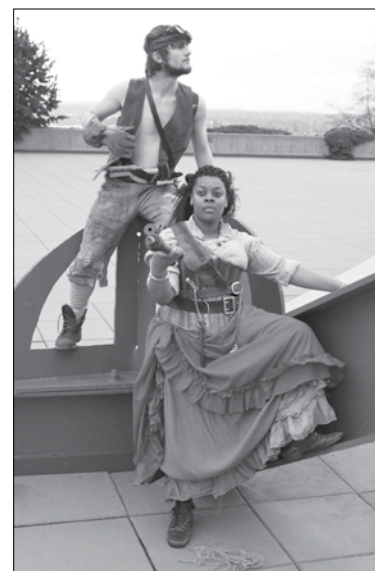
"Pirates of Penzance" featured Theatre and Music students as a band of pirates, giggling maidens, and blundering policemen, all amid a "steampunk" design theme.

The Bellingham Artificial Intelligence and Robotics Society, a nonprofit orga-