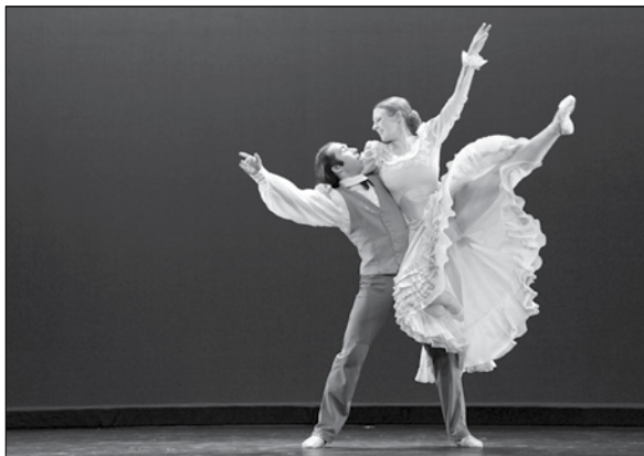
A grant from the National Endowment for the Arts allowed WWU Dance students to restage two pieces choreographed by the legendary Martha Graham, including the Themes and Variations Duet from "Appalachian Spring," above.