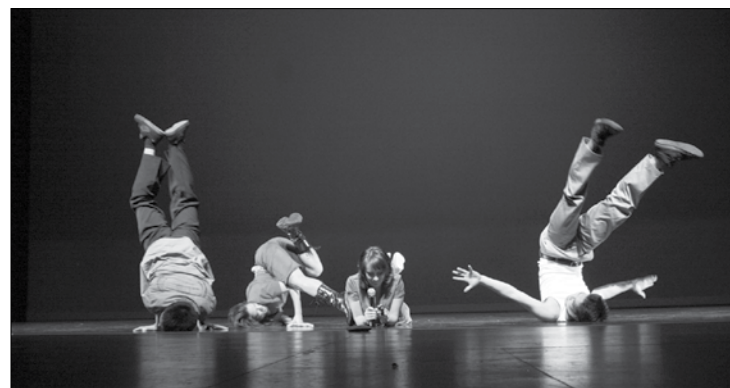
"Cabaret Ving! Bring Me Dance!," hosted by the Dance program in downtown Bellingham, showcased cutting-edge work created by Dance students and faculty.