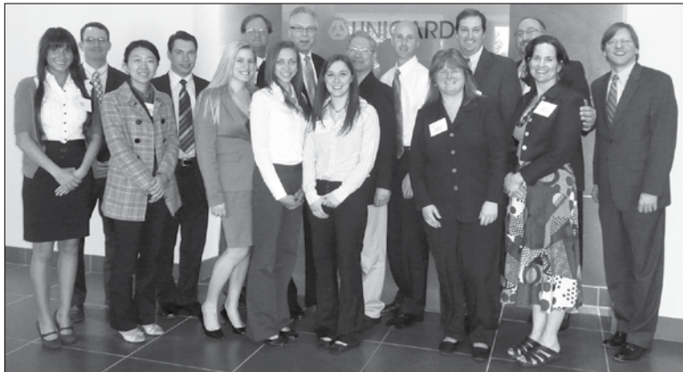
College of Business and Economics students and faculty gather with industry leaders in spring 2011 for the Leadership Lunch at Unigard Insurance Group in Bellevue. The quarterly networking lunches recognize outstanding students in scholarship and leadership.