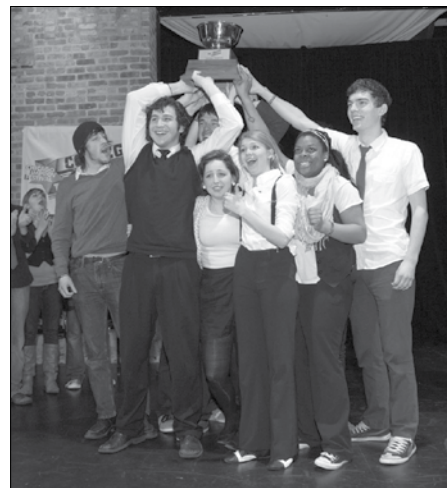
The Dead Parrots Society, Western's improv comedy team, took first place at the National College Improv Tournament.